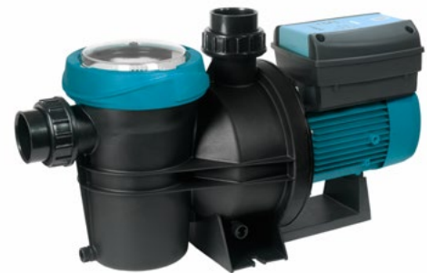
Silenplus 2M and 3M

Download ESPA Evopool App for a better experience and management